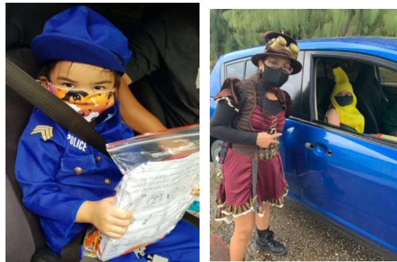
Halloween school supply and treat distribution.

Marcial A. Sablan Elementary School was supposed to have a Full-Study visit in March 2020 but due to the COVID-19 Pandemic, our visit was postponed. We are moving forth with our accreditation process through a virtual Full-Study visit. We are asking parents to participate once we have dates for the virtual visit confirmed. Please contact the school at masestars@gdoe.net if you are willing to sit in our committee meetings and virtual visit.