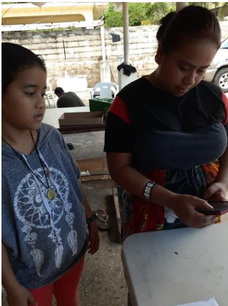
Parents working in partnership with the teachers during the pandemic to assist with their child's learning.

Please contact the school at masestars@gdoe.net if you are willing to sit in our committee meetings and virtual visit.