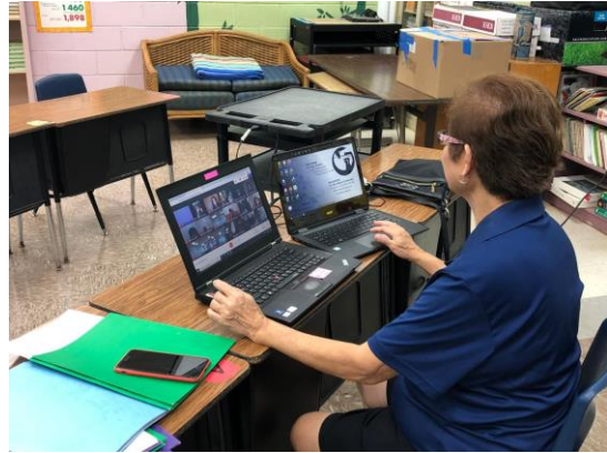
Our teachers are working hard to provide online learning to their students.