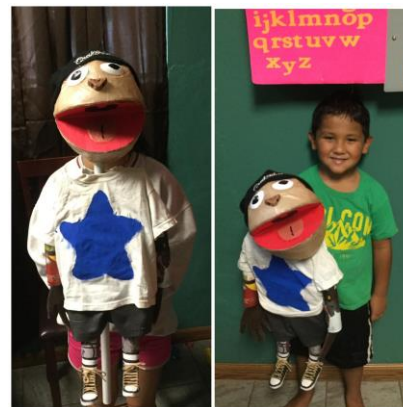
G.A.T.E. Puppet Project